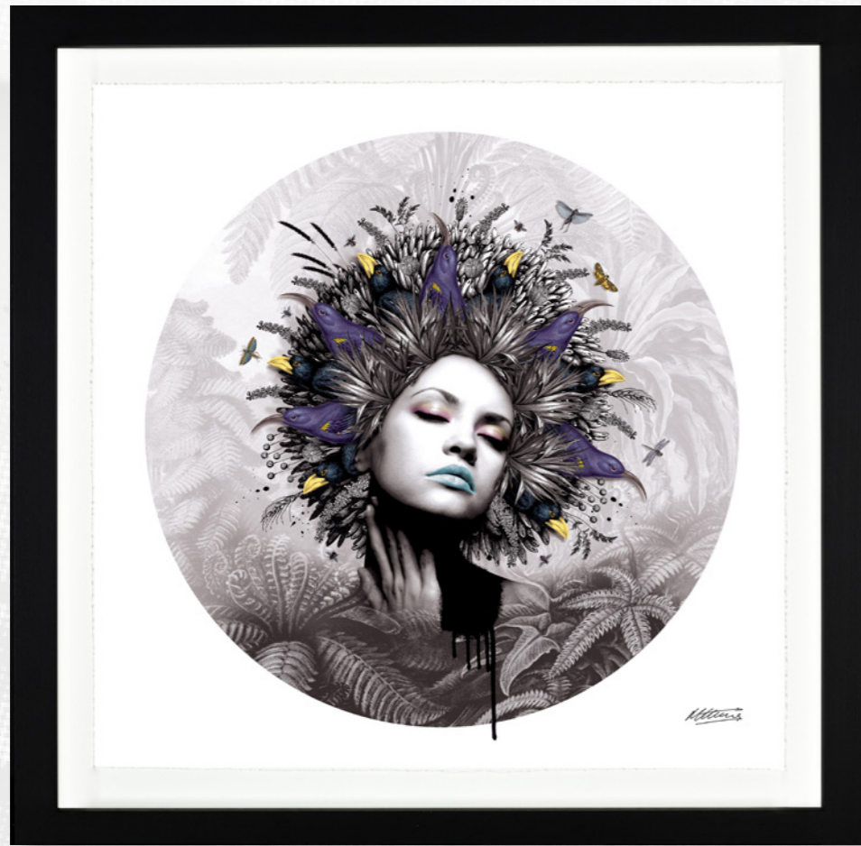
RENEWAL Paper Edition of 195 26x26" £650